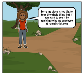
Closing Description: saying good by Action: walk away saying goodbye FIX: zoom out