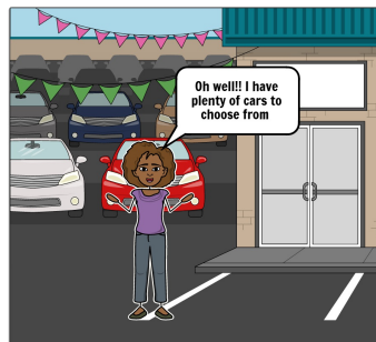
Garage Description: not a problem that the car was stolen Action: shrugg off the fact that the car was stolen FIX: close up