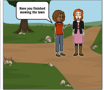
Tech Green Description: ask a random stranger a question Action: go up to a random person FIX: neutral shots