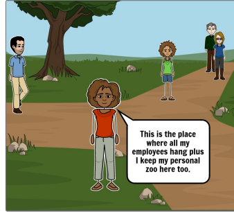
Tech Green Description: zoo and employee hang spot Action: stands in front of tech green and talks FIX: MONTAGE