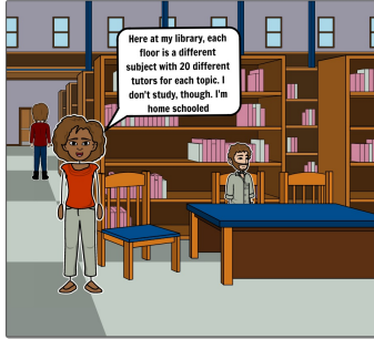
LIBRARY Description: home schooled, personal tutors for different subjects, 7 floors have different subjects, she don't even study Action: walks around a describing things as she goes FIX: neutral shots AND MONTAGE