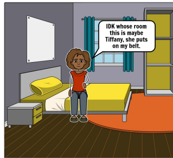
Rooms Description: Naomi gives an example of the ridiculous jobs her employees have Action: thinking FIX: close up