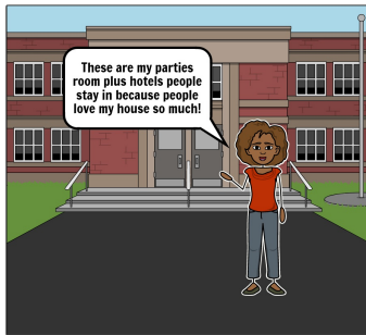
Dorms Description: different parties, guest bedrooms, east/west Action: tour a dorm room and talk about how parties are FIX: MONTAGE