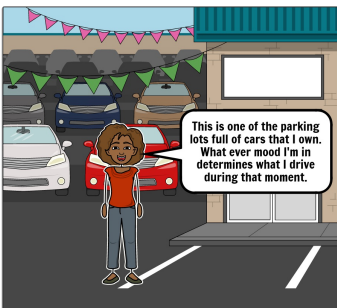
Garage Description: expensive cars Action: explain how many cars Naomi has and how expensive they are FIX: neutral and MONTAGE