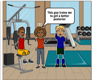
CRC Description: talk to stranger about working out Action: walk up to a random person in the gym FIX: neutral and MONTAGE