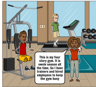
CRC Description: gym, Olympics, basketball, held Olympics there, and all star basketball games Action: walks around and describing items and places as she goes FIX: follows Naomi as she talks and MONTAGE