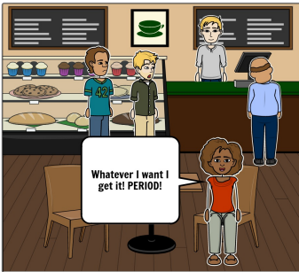
Student Center Description: Tech Rec-playroom, Food Court-kitchen, personal staff Action: walks around and describes things. Talks to food staff on how they like working for me FIX: neutral camera follows me and MONTAGE