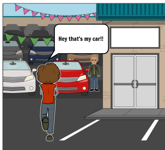
Garage Description: stolen car Action: yell at someone who is taking a car FIX: zoomed out MONTAGE