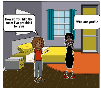
Rooms Description: asking someone how they like the rooms Action: go up to someone and ask them a question FIX: close up