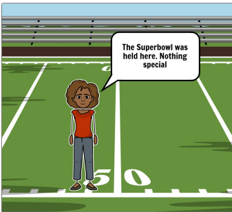
Fields Description: quick scene of Naomi flexing her football field Action: shrugs shoulders FIX: neutral shot