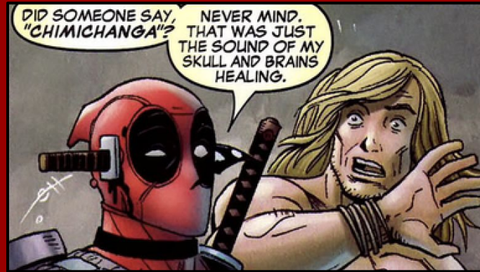
Example images of Deadpool regenerative healing power, allowing him to survive fatal injuries