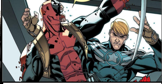
Deadpool fighting Captain America