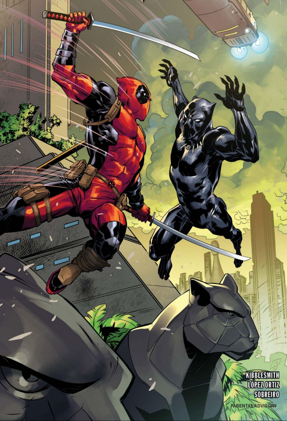
Deadpool fighting Black Panther