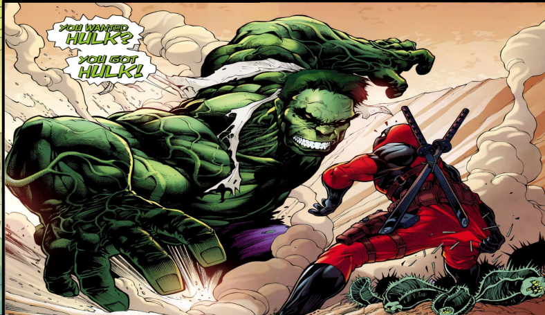
Deadpool fighting Hulk