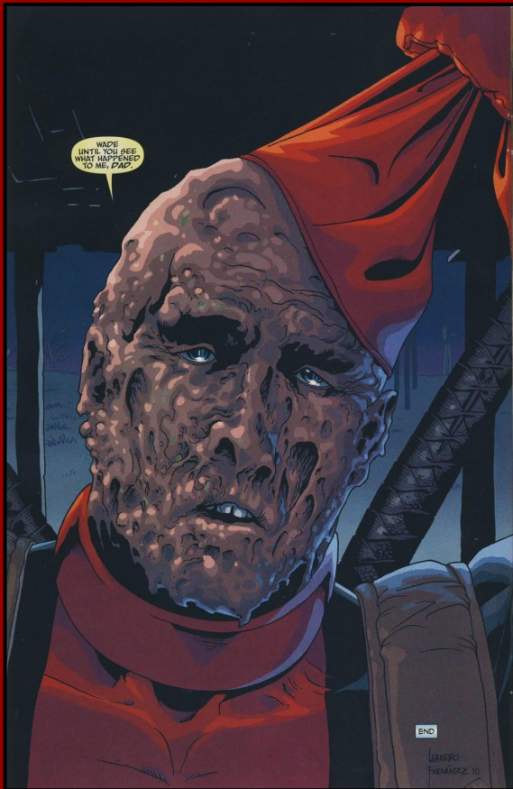
His disfigured and mutilated appearance after weapon x