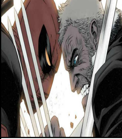
Deadpool fighting Logan