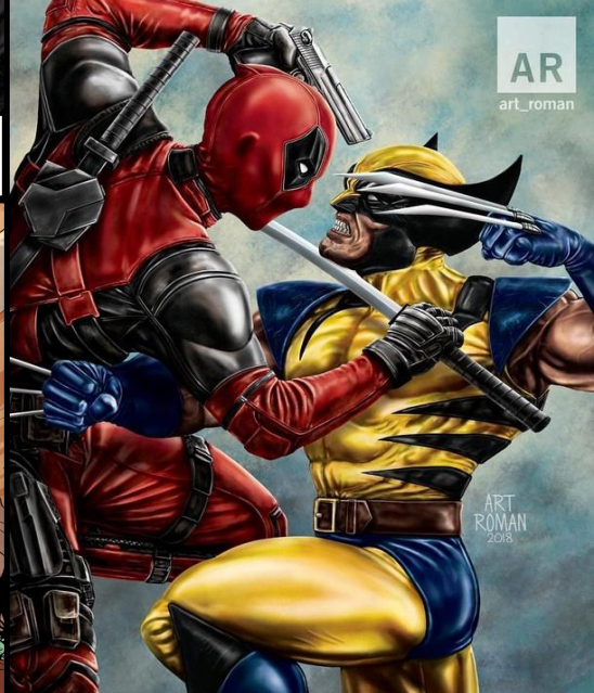
Deadpool fighting wolverine