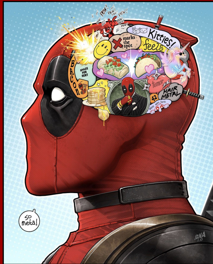
His damaged and chaotic mental state after weapon x